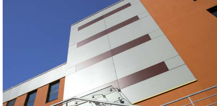
Delivered in December 2014, supported by ERDF. Manufacturer: LCR

* BpiFrance Franche-Comté manages the regional fund for support to innovation set up by the local region and départements and the Grand Besançon conurbation to support all innovative work. BpiFrance Franche-Comté contact details: +33 (0)3 81 47 08 30