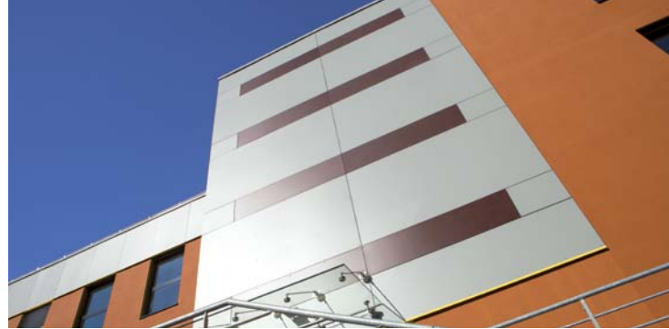
Delivered in December 2014, supported by ERDF. Manufacturer: LCR

* BpiFrance Franche-Comté manages the regional fund for support to innovation set up by the local region and départements and the Grand Besançon conurbation to support all innovative work. BpiFrance Franche-Comté contact details: +33 (0)3 81 47 08 30